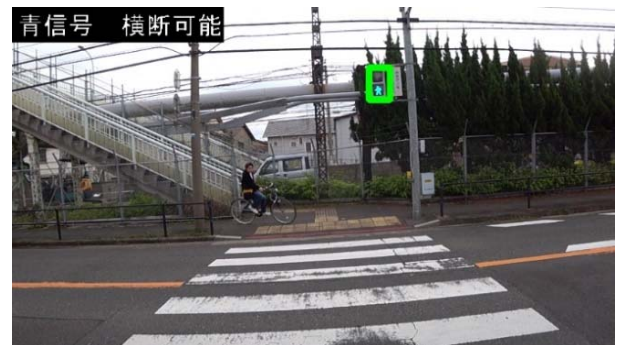
Fig. 3. Part of the experimental video.

We proposed a method of detecting and analyzing pedestrian traffic lights from MY VIOSIN images. The effectiveness of the proposed method was verified by experiments. We plan to analyze not only traffic lights but also other kinds of information for a visually impaired person to walk safe in an outdoor environment, and consider developing a navigation system that is more appropriate to the actual environment.