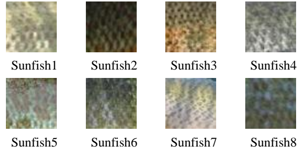
Fig 1: Body texture pattern of sunfish