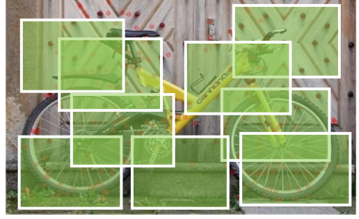
Fig. 1. Multiple-windows set on an object image.