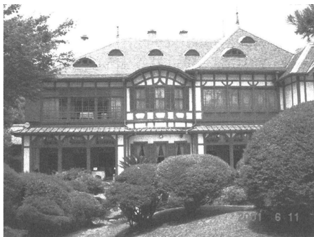
Former Matsumoto Residence

The vast Tokyo Station may be regarded as the Japanese version of a triumphal monument such as the Arc de Triomphe in Paris or Berlin’s Siegessäule . It was built not only for practical reasons but also to celebrate victory in the Russo-Japanese War (1904–5), and although it remains a substantial landmark building it seems suitably restrained and modest to fulfil this purpose, for the war was won at a dreadful cost in both lives and finance. Japan did not get everything