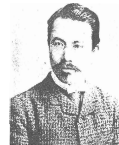
Tatsuno in England, 1888 ( Tatsuno Kingo Den )

In January 1889 Tatsuno travelled to continental Europe, leaving Okada (and presumably Sakurai) in London. Finding the new Belgian Banque Nationale building (now the bank’s museum at No. 10,