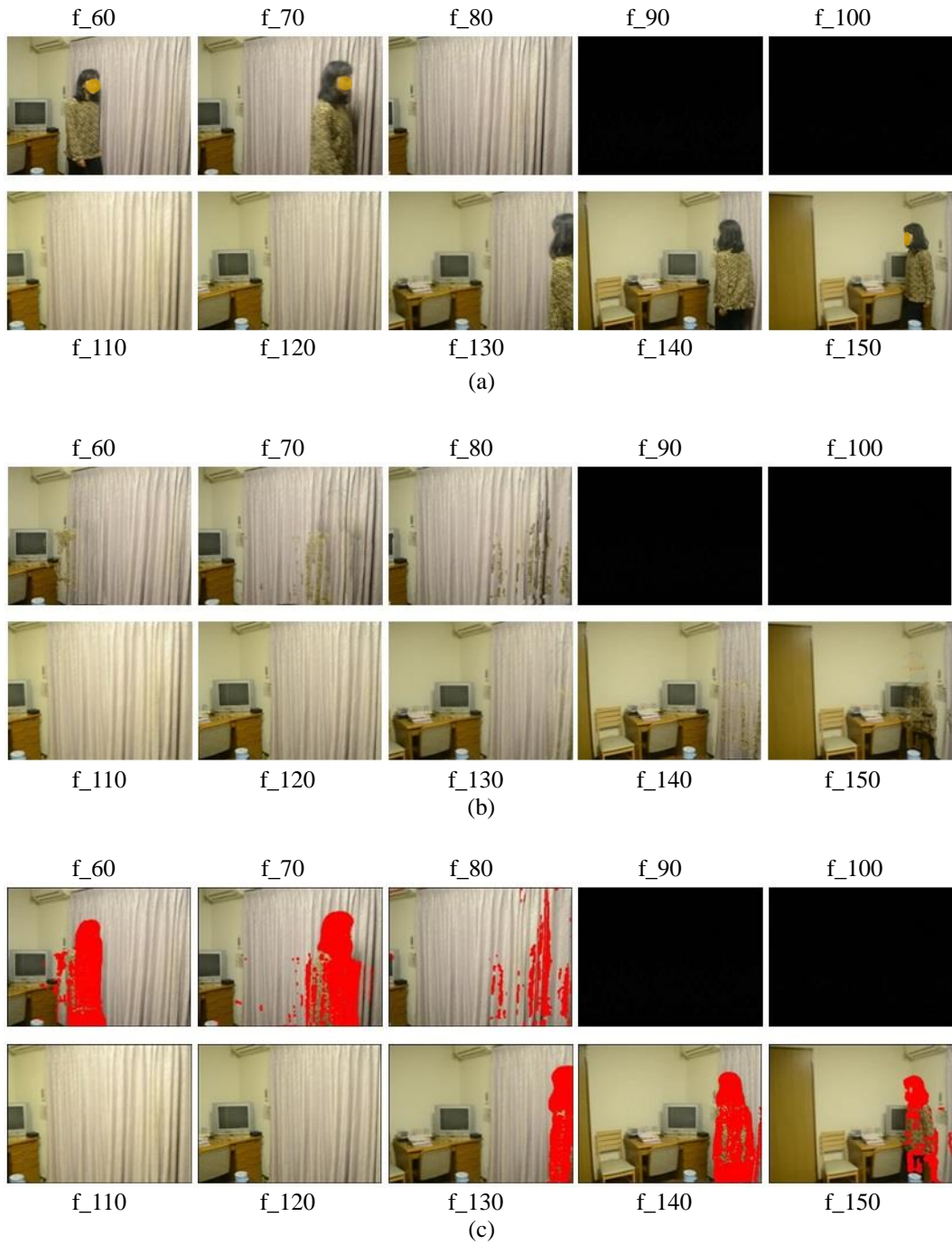
Fig. 3. Foreground object detection in the case of large illumination change: (a) Part of the original image sequence, (b) the background model employing Eqs.(3,4), (c) the result of moving object (foreground pixels) detection: Foreground pixels are indicated by red.